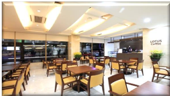
✓1F Lotus Coffee