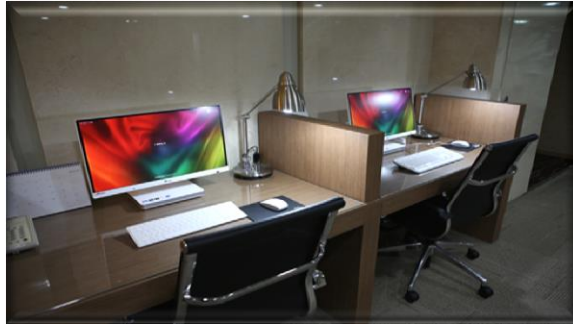
✓B1F Gym & Business Center