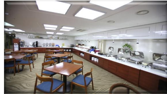
✓B1F Pine Tree Restaurant